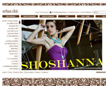
Urban Chic Online