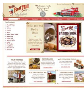
Bob's Red Mill